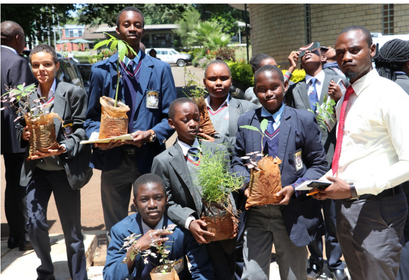
Students with tree seedlings they promised to plant in their school