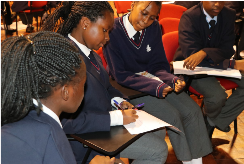
During a biology class, at Sugiyama Hall