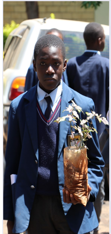
A student holding a seedling during a visit at CEMASTEА

This culture is supported by the fact that CEMASTEА has made tree seedlings readily available from different varieties ranging from fruits to hardwood trees.