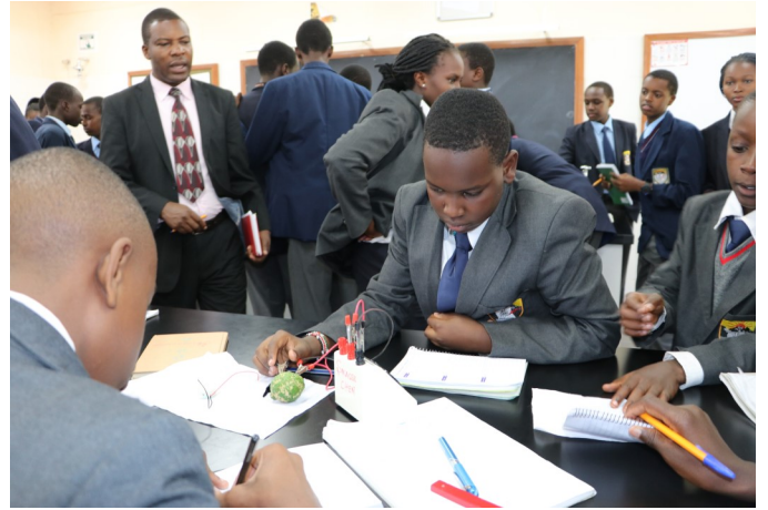
Students during a Physics practical