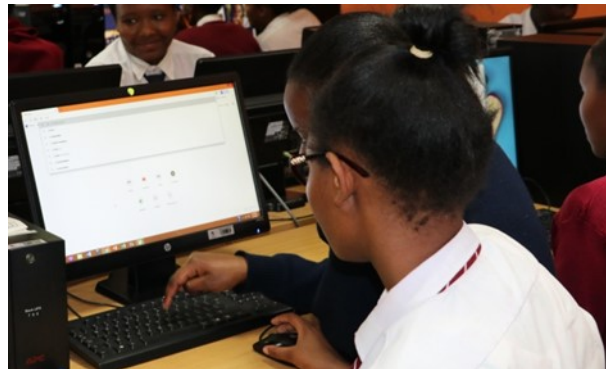
R-learners engaged in the browsing activity.