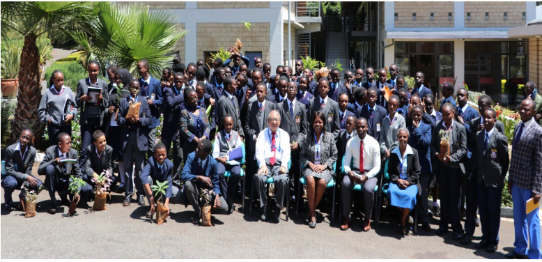
Juja Preparatory students with The Director ,CEMASTEA.