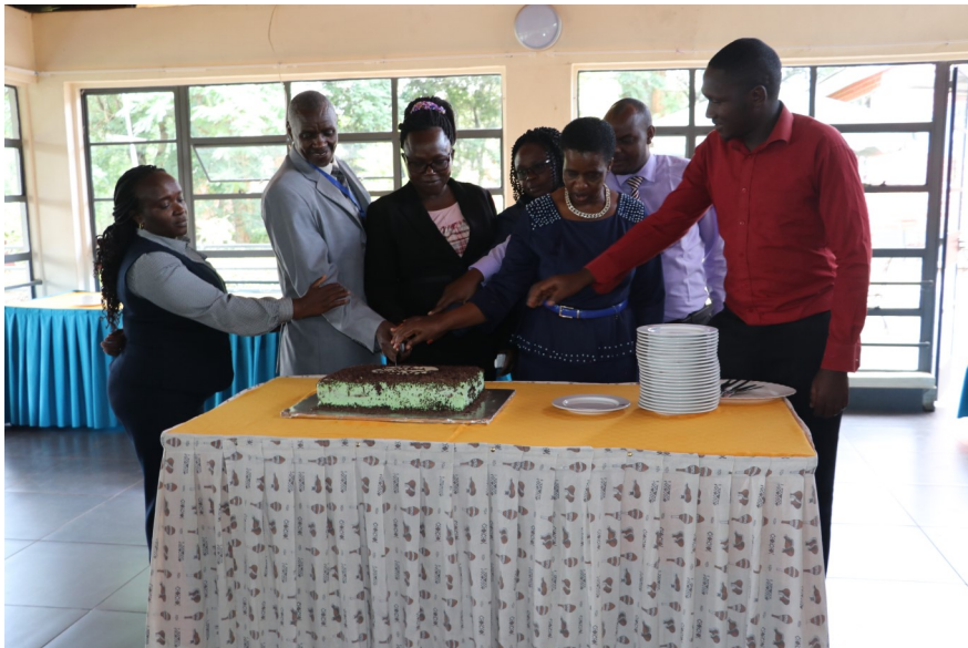
Cake cutting by staff